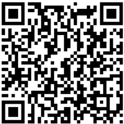
Delgado Health Pass